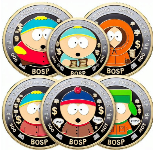
Individual Character Tokens